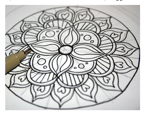
Figure 1. The designs of mandala art therapy

Concerning the application of mandala designs and coloring them, Cook et al. recommended that mandala art therapy be used as a strategy by elementary school counselors to help students succeed in school. These designs provide an opportunity for students to work in a group to create art (Cook et al., 2016). Besides, Bi and Liu argued that drawing mandala designs is effective in reducing the social anxiety of university students and al-